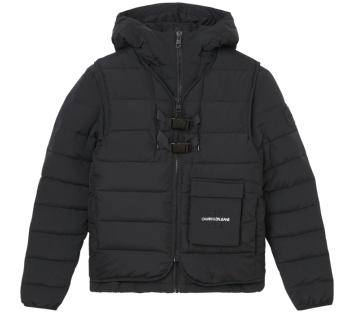
● 2 IN 1 URBAN PUFFER JACKET