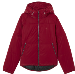
● ● SOFT TOUCH PUFFER JACKET