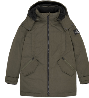
● SHERPA LONG PARKA