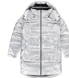
● COCOON OVERSIZED SILVER JACKET