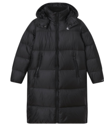
● DOWN SHINNY LONG PUFFER