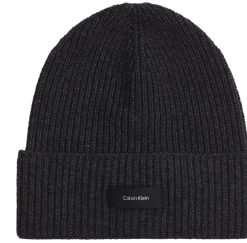
● DADDY WOOL RIB BEANIE