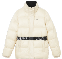
● LONG BELT WAISTED SHORT PUFFER