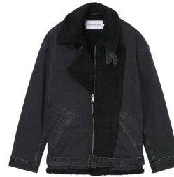
● OVERSIZED SHERPA MOTO DENIM JACKET