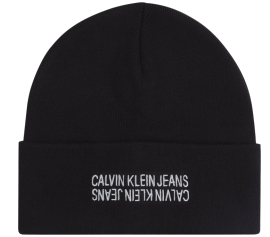
● MIRROR LOGO BEANIE