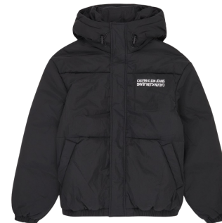
● CRIKLE PUFFER