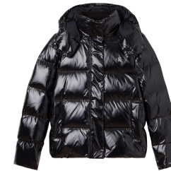
● HIGH SHINE SHORT PUFFER