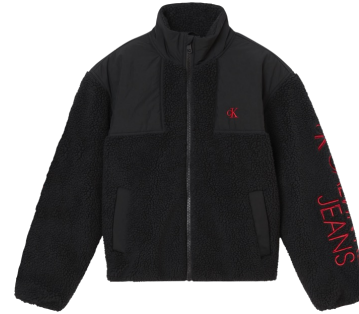
● SHERPA JACKET