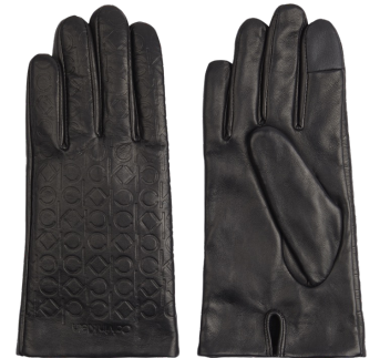
● MONOGRAM LEATHER GLOVES