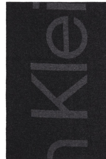
● DRY BRANDING KNIT SCARF 30X180 CM