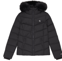
● SHORT FITTED DOWN PUFFER