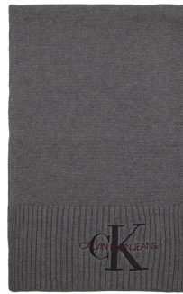
● ● KNITTED BASIC MEN SCARF