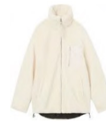
● SHERPA JACKET