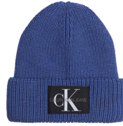
● ● ● ● MONOGRAM BEANIE WOOL