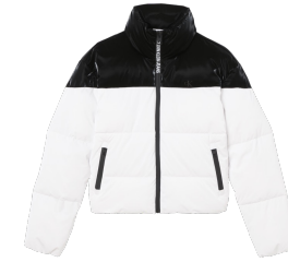
● GLOSSY BLOCKER PUFFER JACKET