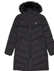
● LONG FITTED DOWN PUFFER