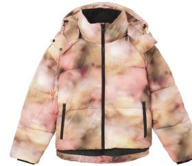
● OVERSIZED BLURRED PRINT PUFFER