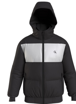
● COLORBLOCKED SPLICED CK PUFFER